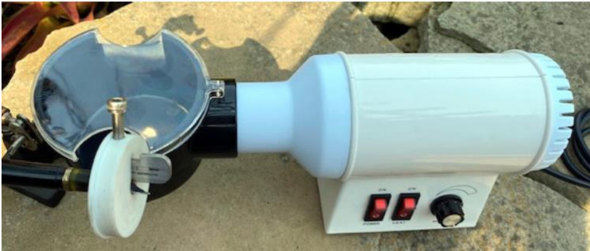
Applying heat with the PT44070 pen warmer.

Be especially careful to avoid getting the section of the pen too hot. It can soften up and distort, especially when applying torque and heat at the same time.