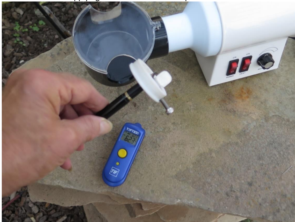
The blue device is an infrared temperature meter which is kept within reach for use to monitor the section temperature.